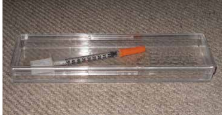
Pictured above: Puncture-proof container from Hindelbank Prison.

With a PNSP in place, authorized injection supplies are not contraband items that need to be concealed, and prisoners are required to keep them in a predetermined spot in their cell, usually inside a puncture-proof container, for example the one pictured here from Hindelbank Prison in Switzerland.