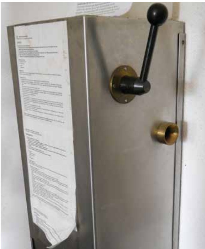
Pictured above: Dispensing machines installed in Hindelbank Prison in Switzerland.