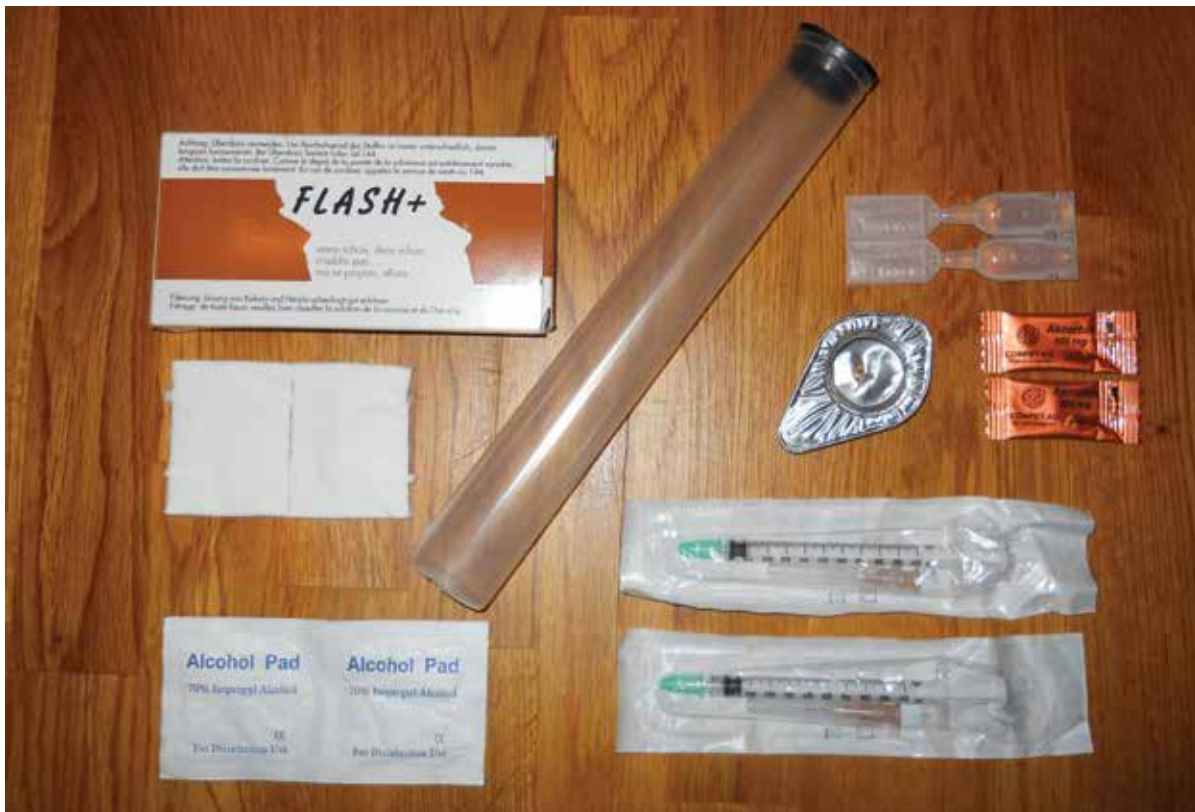
Pictured below: Injection supplies given to prisoners at Champ-Dollon Prison in Switzerland

Regardless of the distribution model, or combination of models, prisoners who are part of the PNSP must typically keep their supplies in a pre-determined location in their cell and injection equipment must stay within the kit or puncture-proof container to help prevent instances of prisoners or staff being accidentally pricked by a needle. At Champ-Dollon Prison in Switzerland, for example, prisoners are given injection supplies and a clear puncture-proof tube in which to keep their syringes, pictured here.